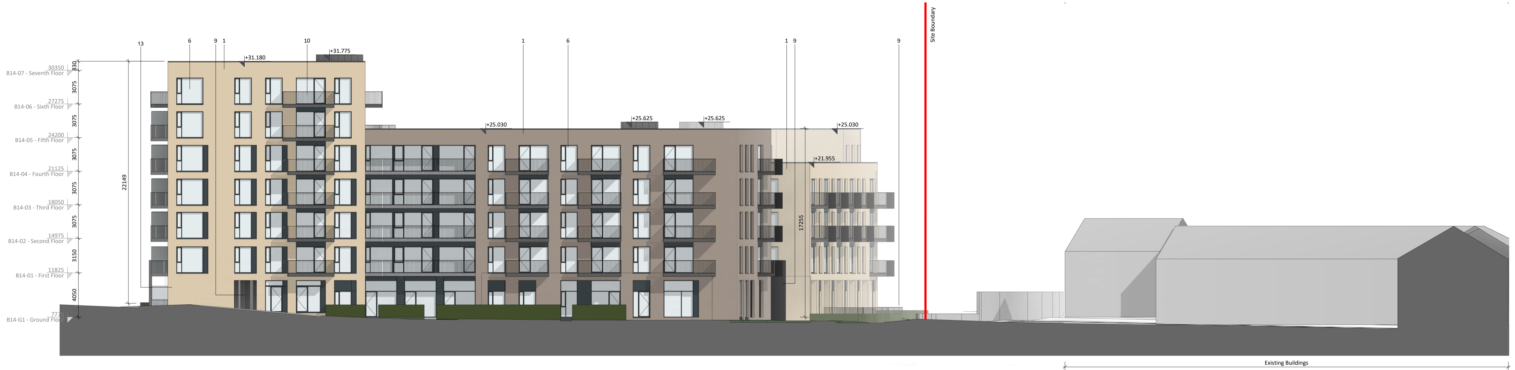
② B14-South West Elevation 1:200